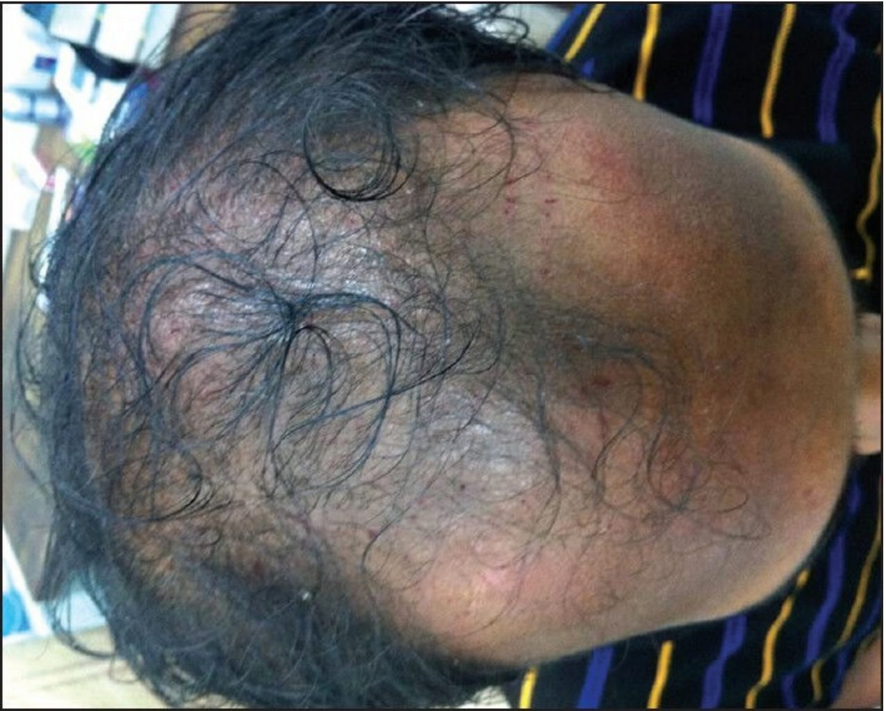
Pre-treatment clinical photograph