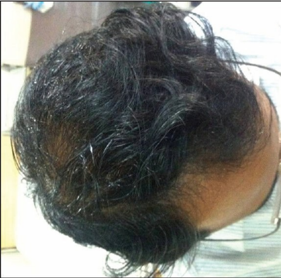
Post-treatment clinical photograph

Articles from Journal of Cutaneous and Aesthetic Surgery are provided here courtesy of Medknow Publications